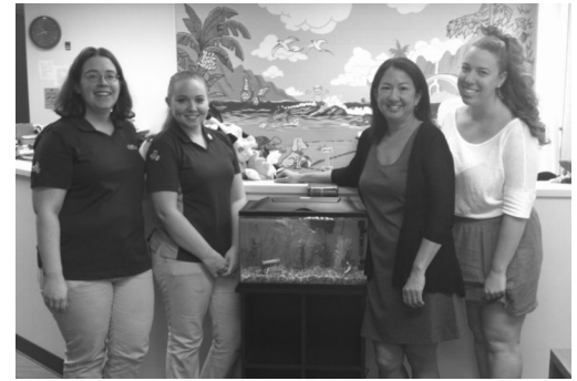
New aquarium from PetSmart

The focus of this first newsletter of the year is to thank our donors who have enabled us to continue serving families and also to share our 2013 accomplishments. At Family Promise of Hawaii, we understand that there are many individuals, businesses, foundations and other social service agencies that provide us with the many areas of support needed to get families back on their feet. We are grateful for their partnership, support and generosity throughout the year.