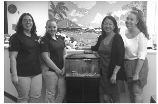
New aquarium from PetSmart

The focus of this first newsletter of the year is to thank our donors who have enabled us to continue serving families and also to share our 2013 accomplishments. At Family Promise of Hawaii, we understand that there are many individuals, businesses, foundations and other social service agencies that provide us with the many areas of support needed to get families back on their feet. We are grateful for their partnership, support and generosity throughout the year.